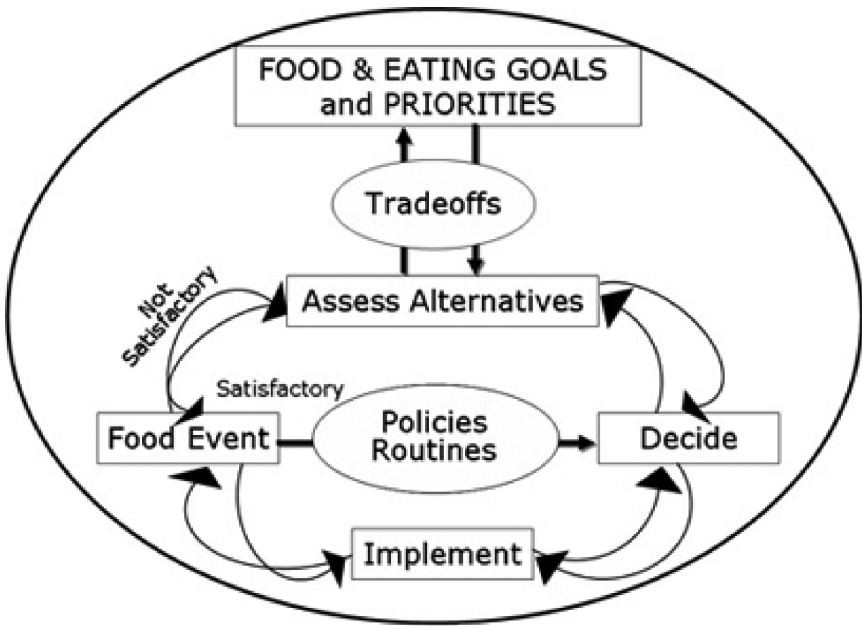
FIGURE 3. Family Food Decision-Making Cycle.

food systems interventions. A family food decision-making unit is any configuration of adults and children who regularly eat together, or eat from the same household food resources, and who mutually influence decisions about food. Stages in the family food decision-making cycle 17 are (1) determining issues associated with a food event that requires considering alternatives outside the usual routines and established food policies; (2) identifying and assessing perceived practically available alternatives to meet family goals; (3) evaluating and choosing among the alternatives, i.e., deciding; and (4) implementing the chosen alternative. Decisions may be on choice of foods, eating environment, food roles, strategies for mobilizing family food resources, or expected child food behaviors (i.e., family food policies).