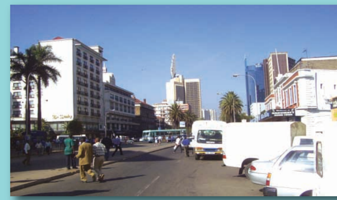
Kenyatta Avenue, downtown Nairobi

The location of Nairobi and its relatively well-developed infrastructure, including a modern airport and commercial centres has led to a very rapid expansion of the city since 1979. The city's population growth has influenced environmental change over the past century as more land was opened up for human settlement, industry, roads and other infrastructural development.